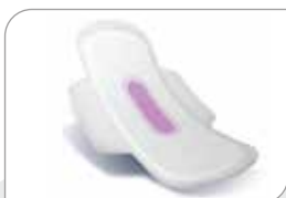
Feminine Sanitary Pads