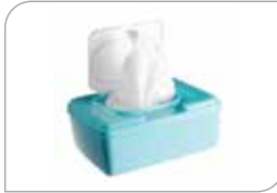
Baby wet wipes