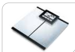
Glass diagnostic scales