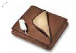
Electric Over Blankets