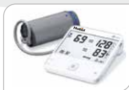
Upper arm measurement