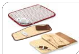
Classic heating pads