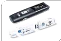
Blood glucose monitor