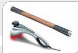
Hand & Body massager