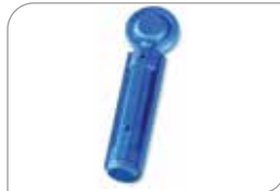
Blood glucose lancet