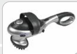
Hand & Body massager