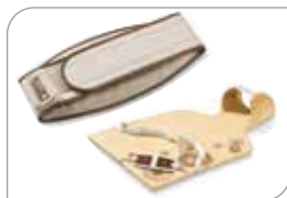
Special heating pads