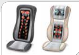
Shiatsu seat covers/Pillows