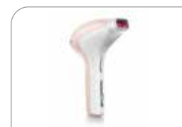
Hair removal device