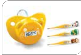
Baby body temperature